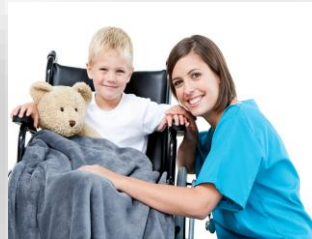
Efficient and Caring Support