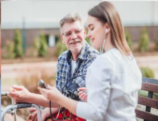
Quick Home Visits