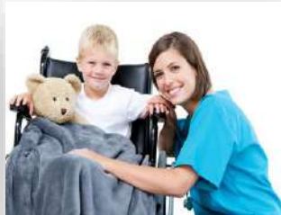
Efficient and Caring Support