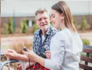
Quick Home Visits